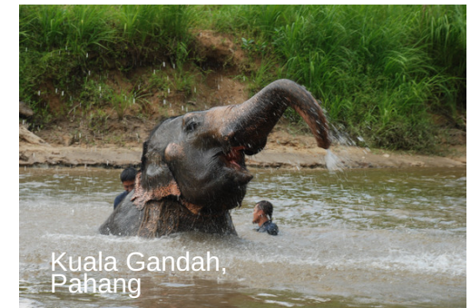
Kuala Gandah, Pahang