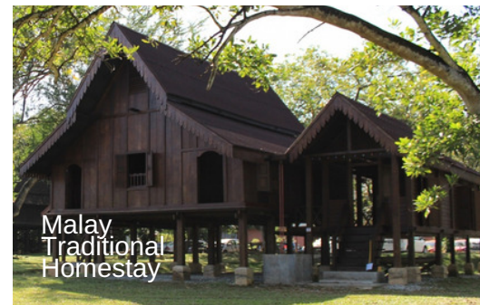
Malay Traditional Homestay