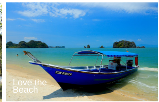
Love the Beach