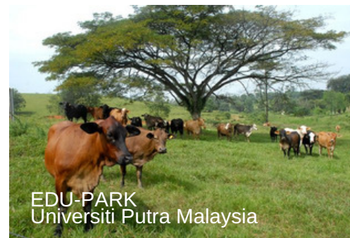
EDU-PARK Universiti Putra Malaysia